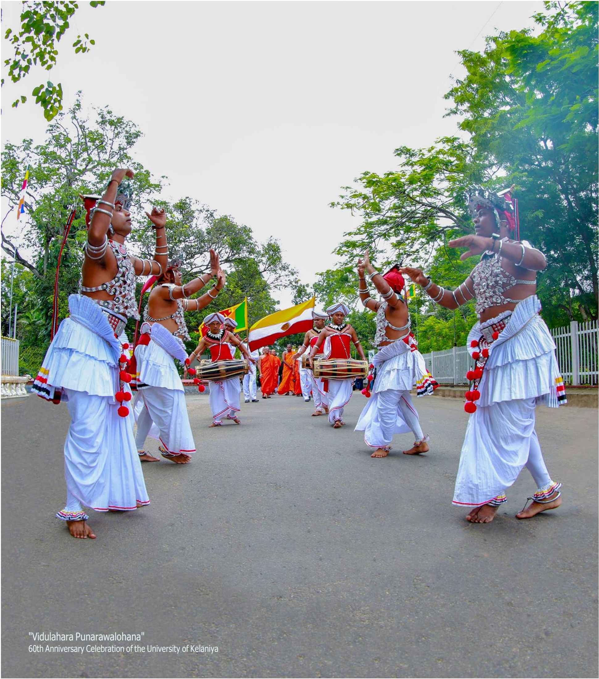
"Vidulahara Punarawalohana" 60th Anniversary Celebration of the University of Kelaniya