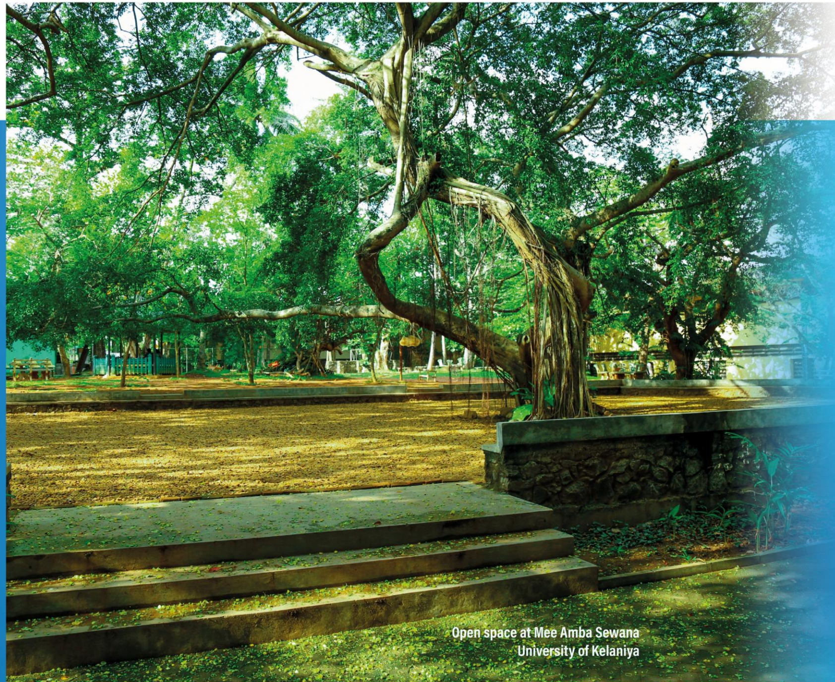
Open space at Mee Amba Sewana University of Kelaniya

"Vidulakara Punarawalokana": 60th Anniversary Celebration Later the Vidyalankara - 2019